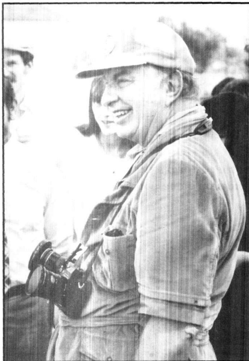
L. Ron Hubbard, Founder

When the groups in Chicago, L.A. and Houston have pushed out to the (continued on next page)