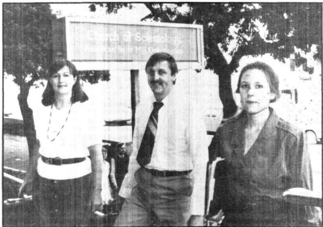
Students come to the American Saint Hill Organizations Day and Foundation to do the Saint Hill Special Briefing Course on their route to full OT* ability.