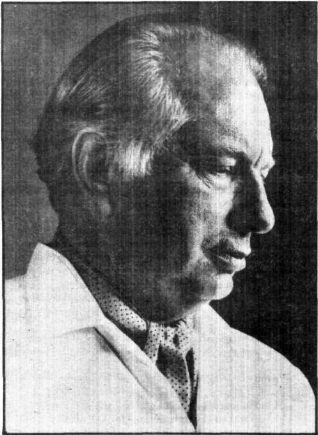
L. Ron Hubbard

Published by the American Saint Hill Organization Day and Foundation, 1413 N. Berendo St., Hollywood, CA 90027; Telephone: (213) 660-5553